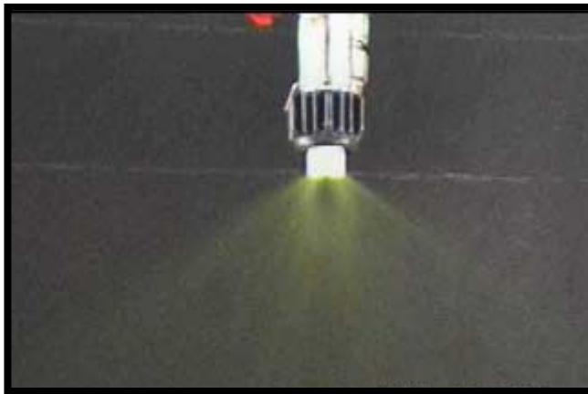
Without ON TARGET