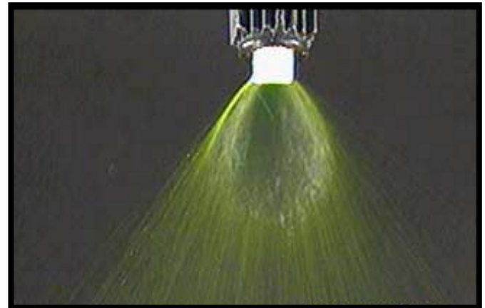
With ON TARGET

Precision agriculture means less room for mistakes. Margin for error can be managed by following a simple three-step process to good spray management 1) Good judgment , 2) Proper equipment , 3) Use ON TARGET drift management adjuvant .